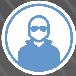
THE COMPLETE STRANGER