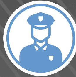
THE HELPFUL STRANGER