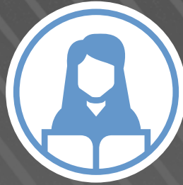
THE FAMILIAR STRANGER