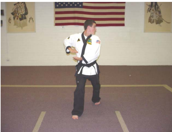
Look left. Load hands on right hip, right over left (approximately 4 inches apart) in knife hand position.