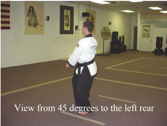
Execute double low punch