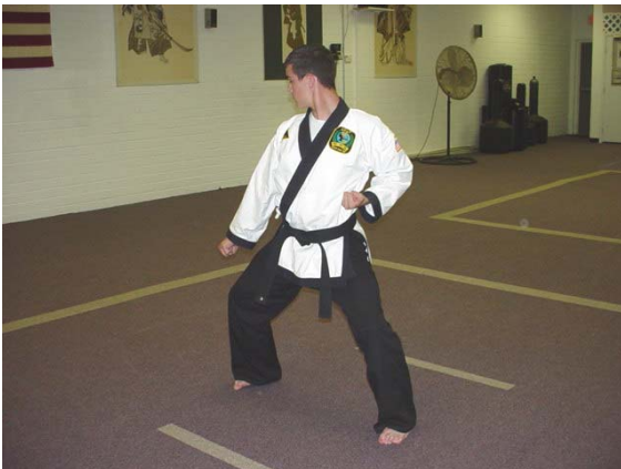
Execute a right hand low block in side stance...