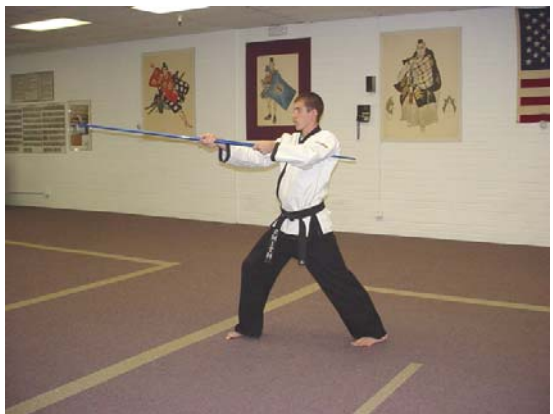
...a left overhead cross strike...