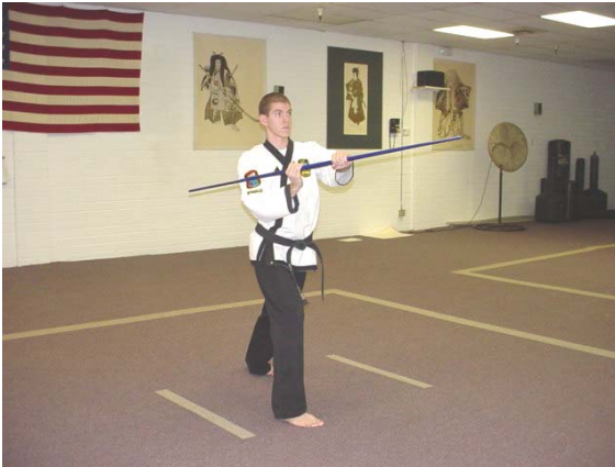
...left cross strike...