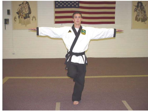
Look left. Turn 180 degrees on left foot. Execute a fast salute... (double break optional)