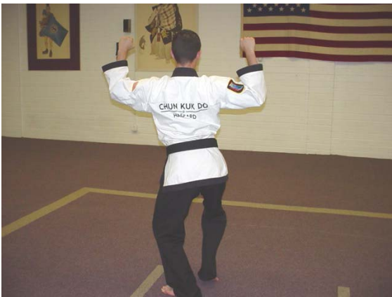
Load for a double hammer fist