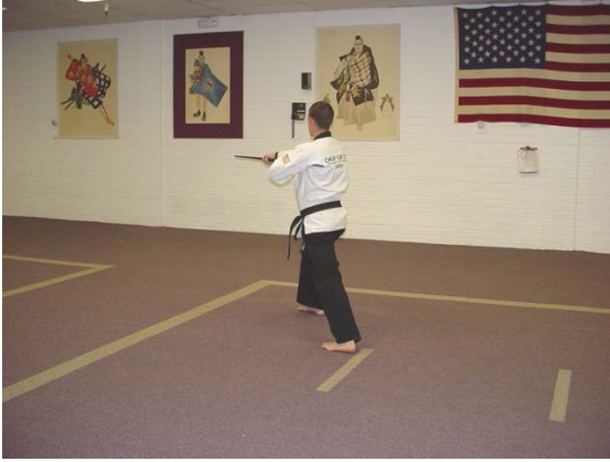
Right thrust in a side stance the opposite direction. Kiai!