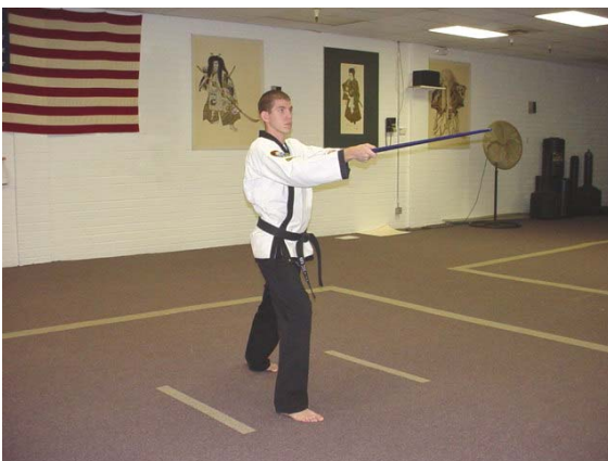
...right cross strike...