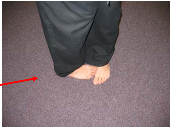
Step down placing the right foot with the toes pointing towards the left instep forming a "T".