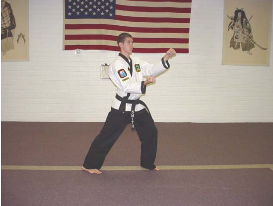
Pull in with right hand palm up.