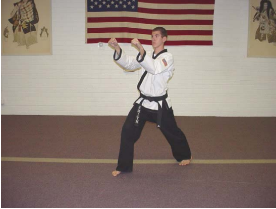
Execute double forearm block, right foot forward front stance.