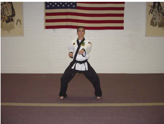
Left center punch into horse stance.