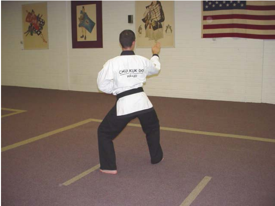
Step into a right center reinforced chop.