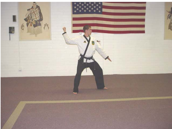
Left foot steps left into a left foot forward back stance, executing a left low chop right back knuckle strike.