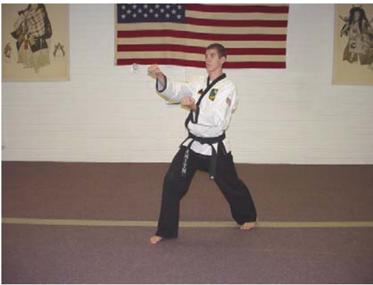
Pull in with left hand palm up.