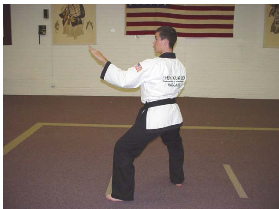
Look left. Turn 180 degrees executing a left high reinforced chop.