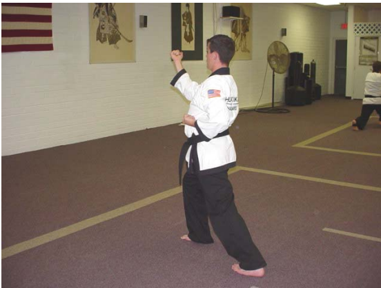
Step back with left foot into a right front stance and execute a right outside block...