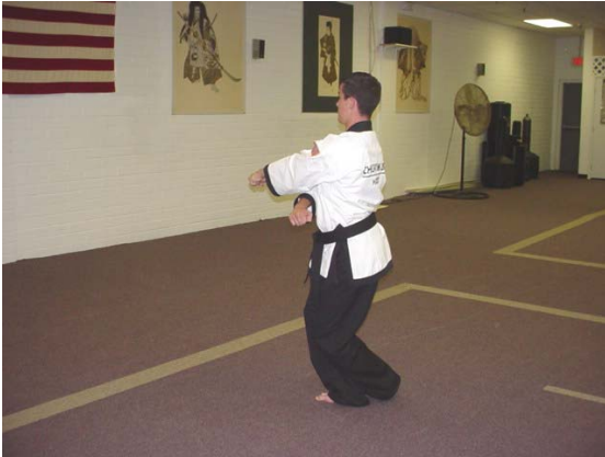
Jam and load for a right outside block.