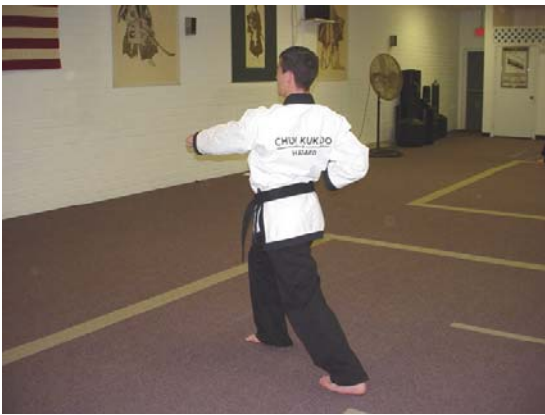
...Left reverse punch...