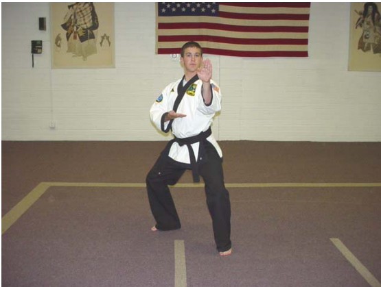
Step through into a left back stance and execute a left reinforced high chop.