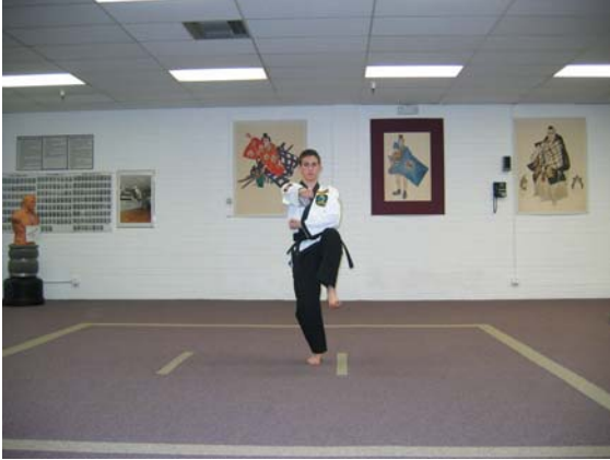
Jam and load for a left high block