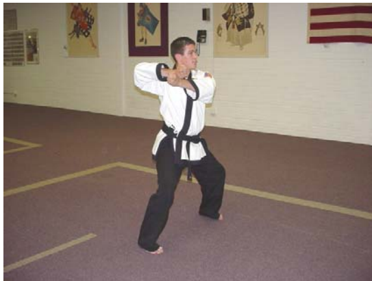
Load high right hand over left for a low cross block in side stance.