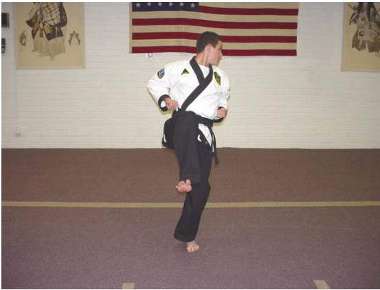
...pivot 180 degrees, step back with right foot into front stance.