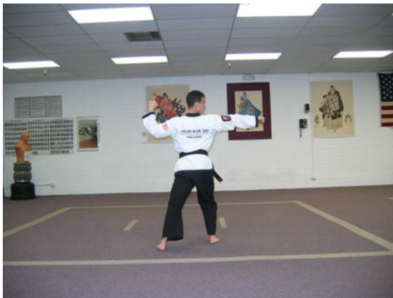
Look right. Jam and load for a left inside block.