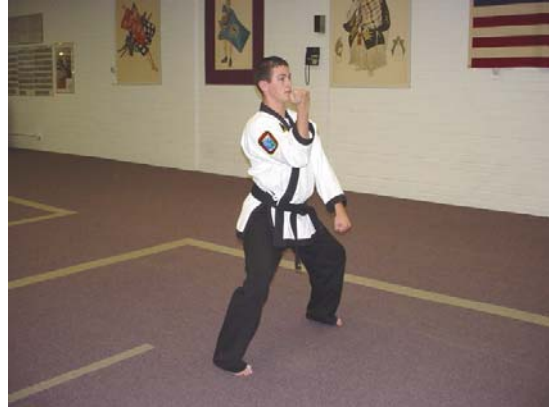
Step through right low block/left outside block.