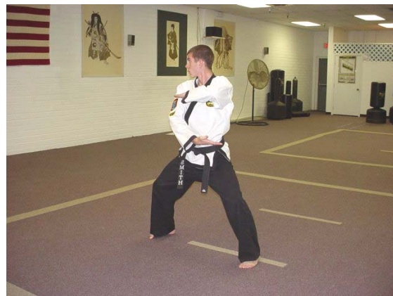
Going down the center, Step into right foot forward side stance ,...