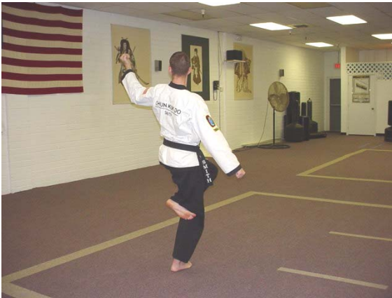
Stepping through bear hug break (Arch back, left foot tucks in behind the right knee).