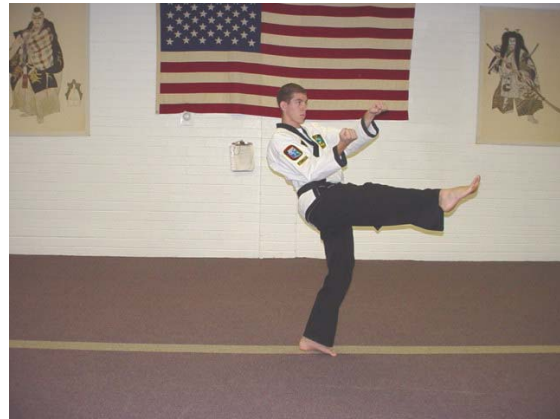
Right stepping front kick, recoil...