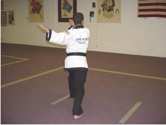
Load for a right high reinforced chop.