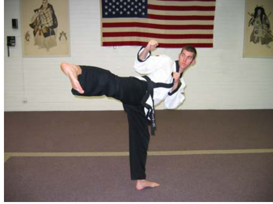
Execute a right side kick to the solar plexus with full recoil.