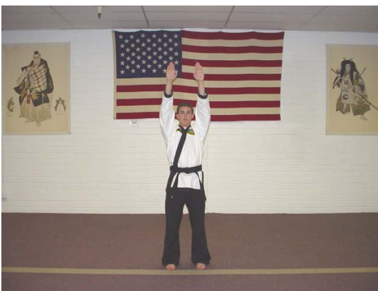
Separate hands into knife hands, at 11 & 1 o'clock positions at the same time snap your eyes forward.