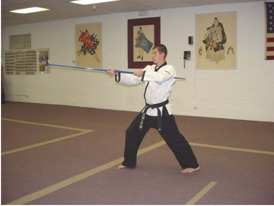
...a right cross strike...