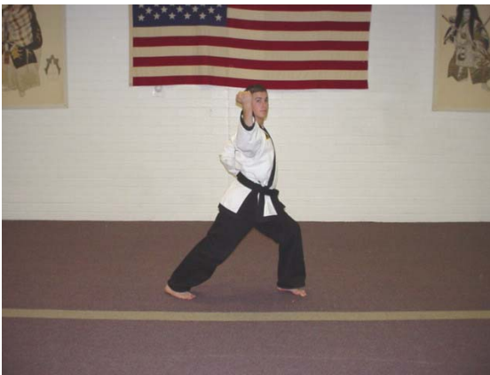
Execute outside block with full hip turning 45 degrees to the left.