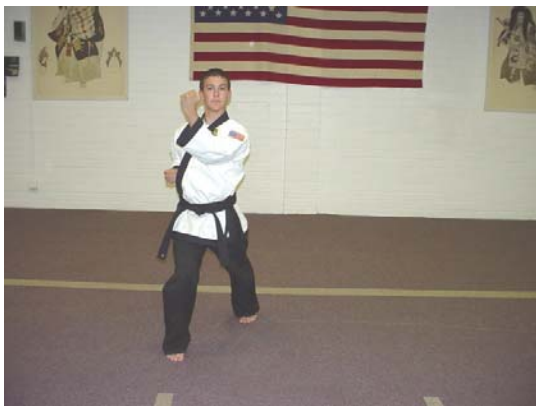
Stepping across with the right leg, turn 180 degrees to the right into a right front stance and execute a left reverse inside block.