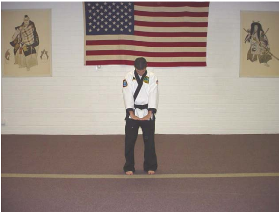
Salute. Form a delta with thumbs and forefingers. Eyes look through the delta. Raise hands upward to a 60-degree angle.