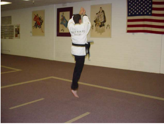
Phase 2 front kick landing with right foot in front on left knee in a low block Kiai!