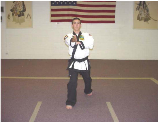
Execute a stepping reinforced spear hand into a front stance. Kiai!