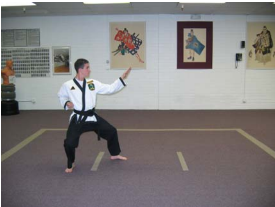
Lunge back (6-8 inches) into a left back stance and execute a left knife hand block.