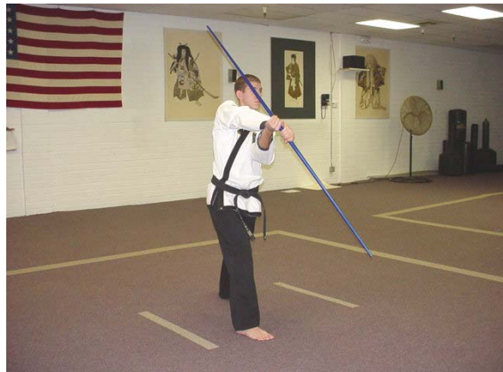
Execute a two handed double figure eight while stepping with the right foot towards the 6 o'clock position...