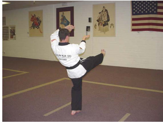
Execute a right stepping front kick...