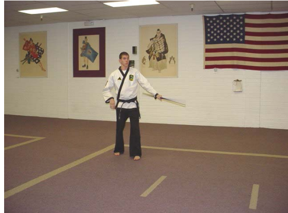
Using slide up footwork, execute a figure eight switch behind the back...