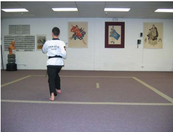
Shift into a right front stance and simultaneously execute a left reverse punch to the solar plexus.