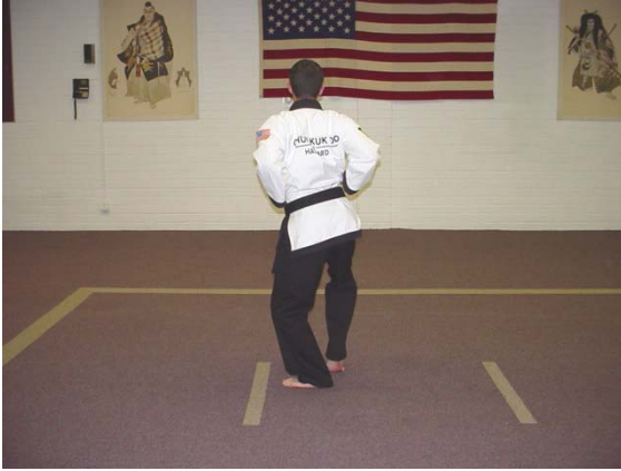
Slide back into a cat stance and load for double low punch