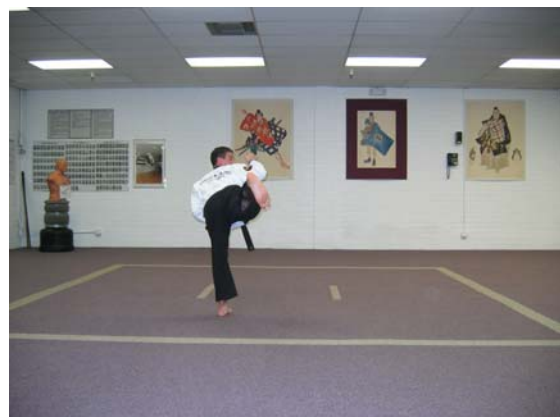
Step down with your left foot and execute a right spinning back kick with full recoil.