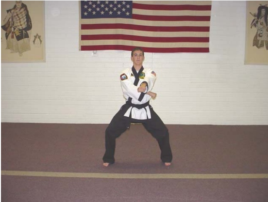
Fold for a right outside block.