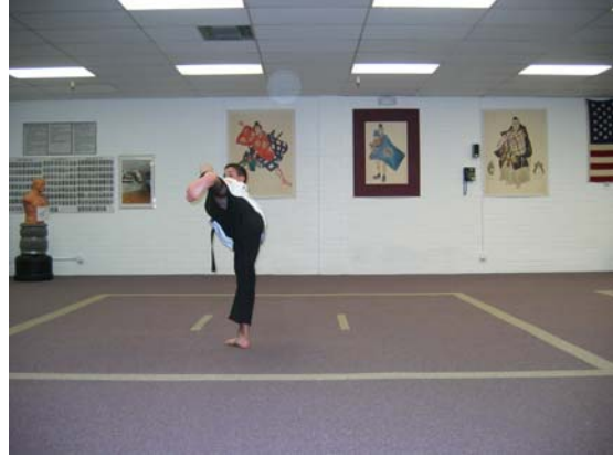
Execute a left stepping side kick to the solar plexus with full recoil.