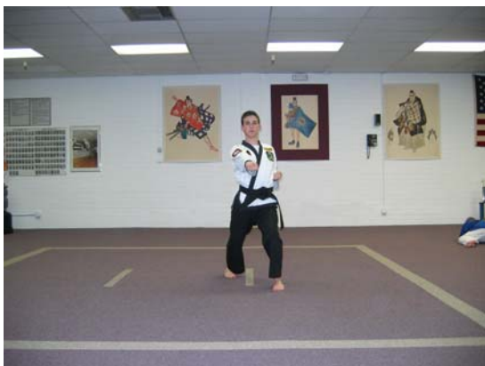
Shift into a left front stance and simultaneously execute a right reverse punch to the solar plexus.