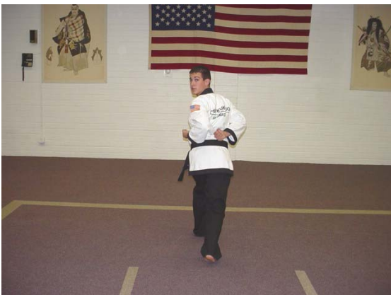
Grab, pull behind the back...