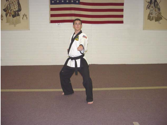
Jam and load for a reinforced spear hand.