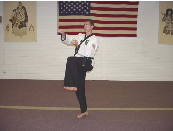
Left stepping front kick, recoil...