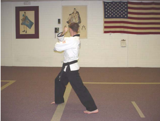
Look right. Jam and load for a right low block.