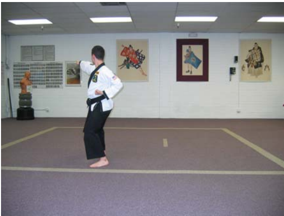
Step down into a right back stance and simultaneously execute a right bottom fist to the temple.