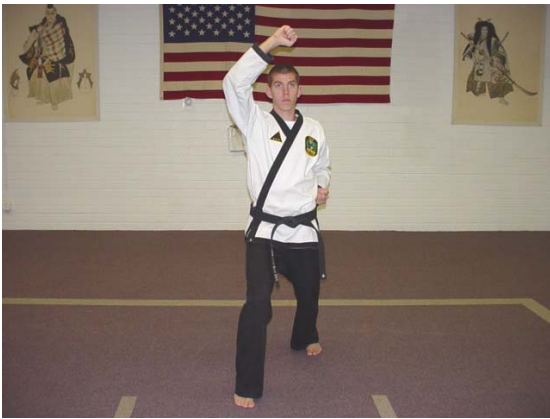
Step forward into a right foot forward stance high block.