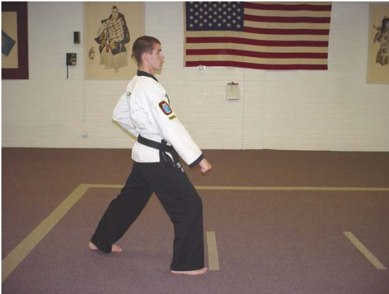
Turn 180-degrees and execute a right low block in a front stance.