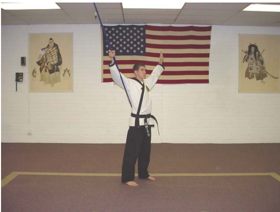
While holding the bo, your right hand will cross in front of your waist and over the left arm, both arms making a large circle back around to your sides...