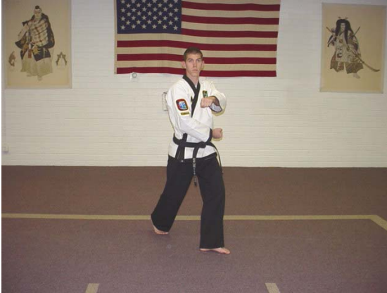
Jam and load for a right high block.