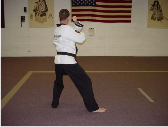
Look left. Jam and load for a low block.