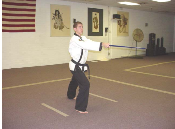
...right thrust. Kiai!