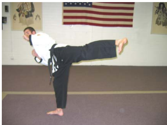
Execute a left side kick to the solar plexus with full recoil.