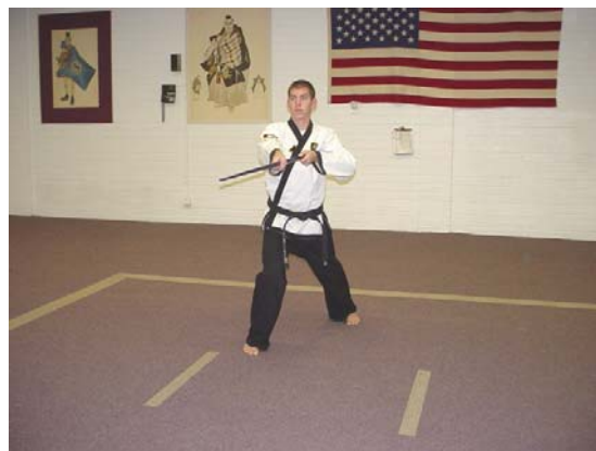
...and right thrust. Kiai!