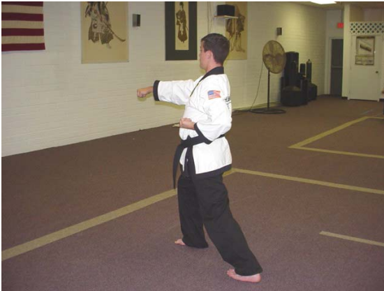
...right center punch.