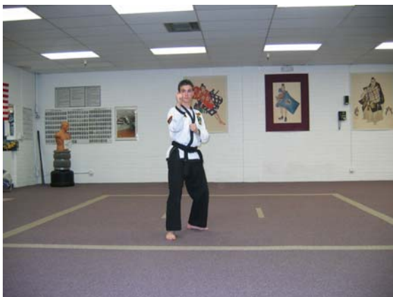
Step down into a right fighting back stance.