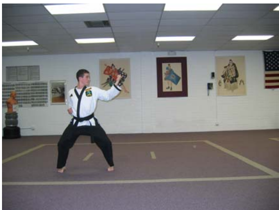
Pivoting clockwise on the left foot 270 degrees into a horse stance and simultaneously execute a left inside block.