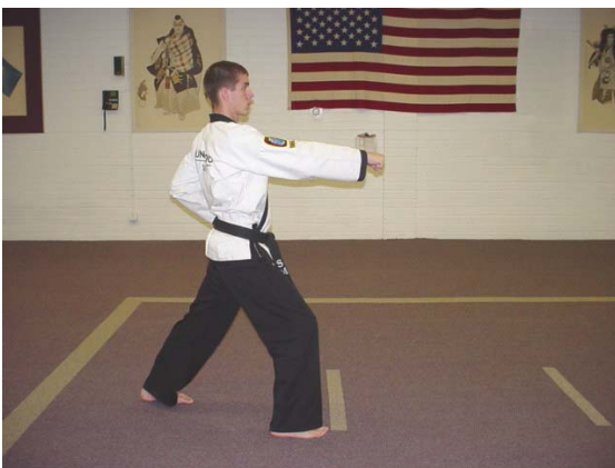
Stepping left hand center punch in left front stance.