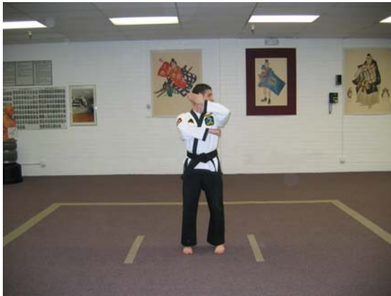
Look left. Jam and load for a left knife hand block.