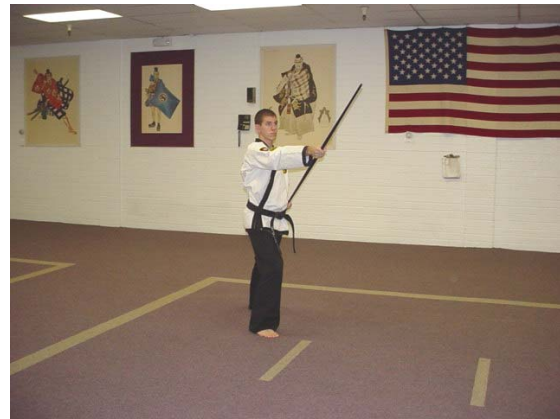
...step forward with your right foot towards the 10 o'clock position executing a right inside downward strike. Kiai!