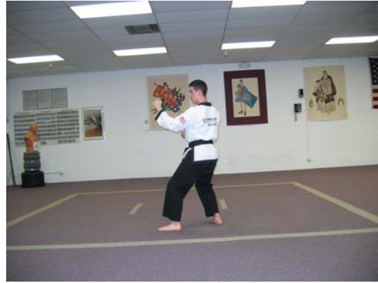
Step down into a left fighting stance.