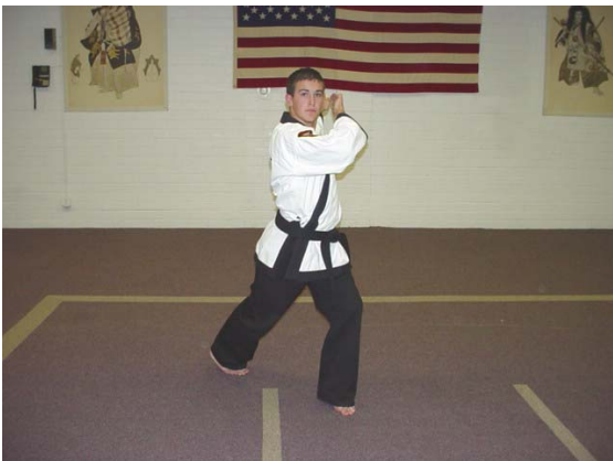
Load for a right reinforced chop