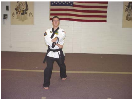
Jam and load for a right outside block.