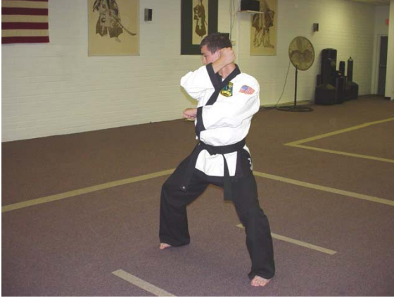
Jam and load for a right hand low block.