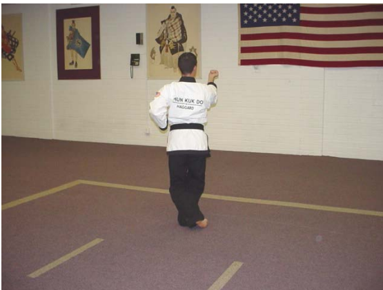
Execute a right downward extended back knuckle landing with feet crossed (left behind right).