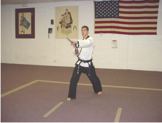
...a left cross strike...