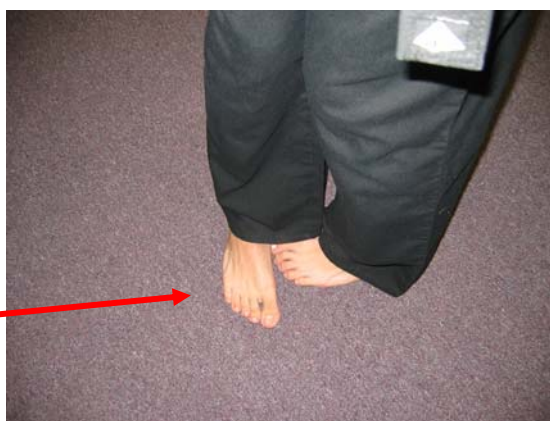
Step down placing your left foot facing the instep of the right forming a "T" .