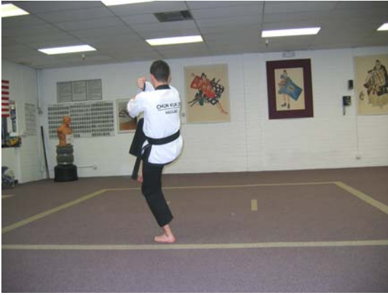
Jam and load for a right bottom fist.