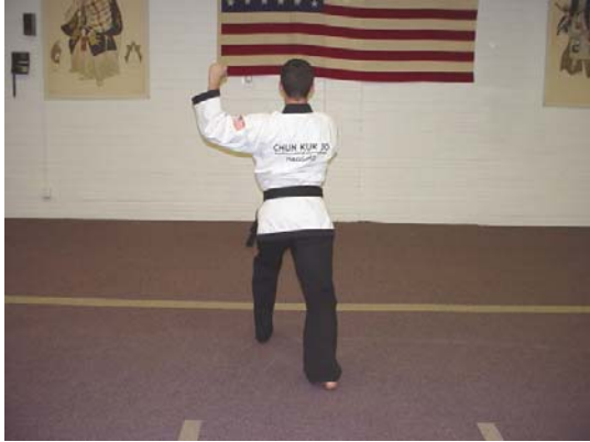
Jam and load for a left reverse inside block.