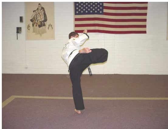
Without moving the left foot twist your body clockwise and load for a right sweeping hooking heel kick. The foot sweeps for approximately 12 inches before performing the hook. The triple kicks must be performed at three different levels of the body.