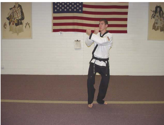
Turn 45 degrees to the right folding for a double forearm block. Left arm on the out side.