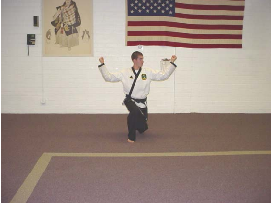
Execute double outside block.