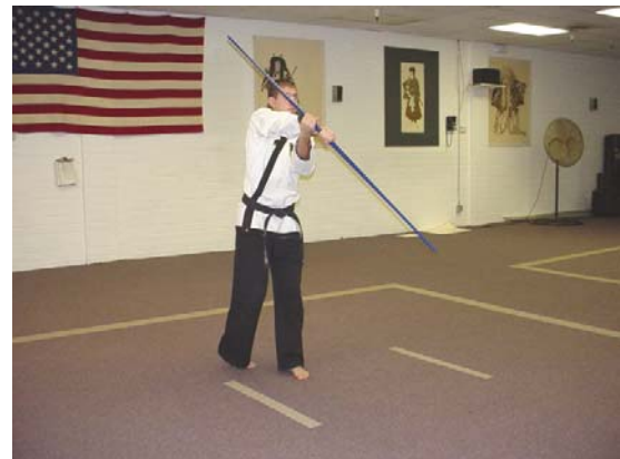
...spin stepping back with the left foot into a modified left front stance...