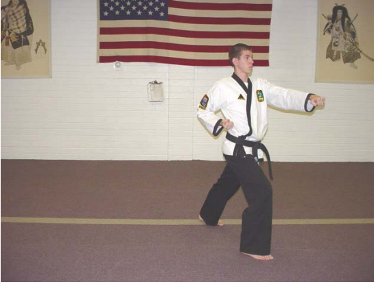
Left reverse Punch..