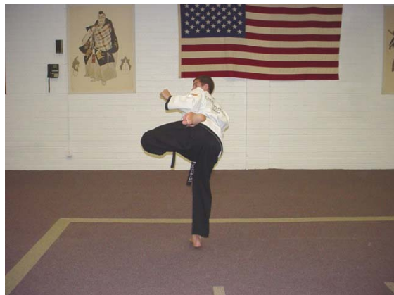
Without moving your right foot, twist your body counter clockwise and load for a left sweeping hooking heel kick. Execute the left hooking heel kick to the temple with full recoil. The foot sweeps for approximately 12 inches before performing the hook. The triple kicks must be performed at three different levels of the body.