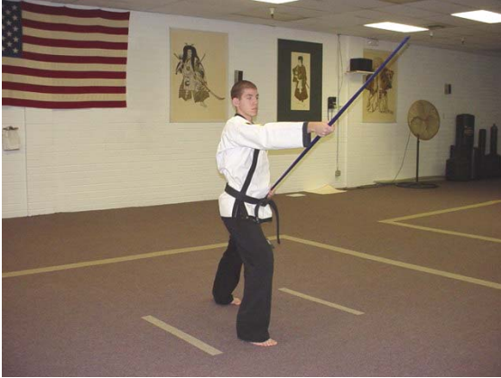
...right outside downward strike...