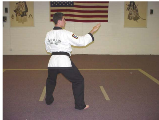
Look right. Turn 90 degrees executing a stepping right high reinforced chop.