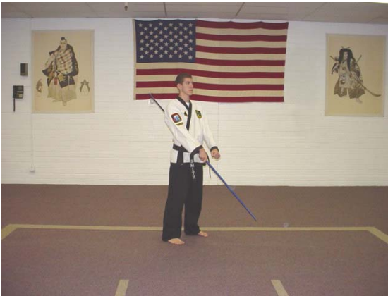
Snap your head and eye contact 45 degrees to the left and step back with your left foot 45 degrees in a ready position. Kiai!