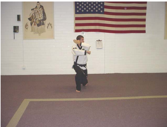
Look left. Load for a left low chop.