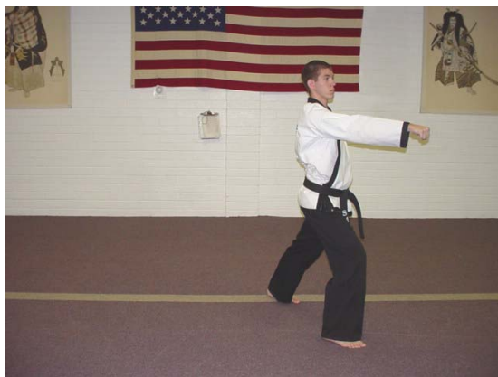
...land in a right front stance and right center punch.