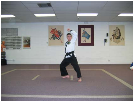
Step down with the left foot into a left back stance and simultaneously execute a left high block.