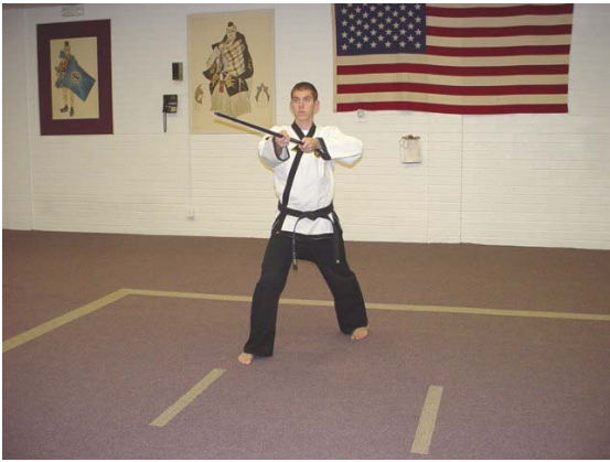
...right cross strike...