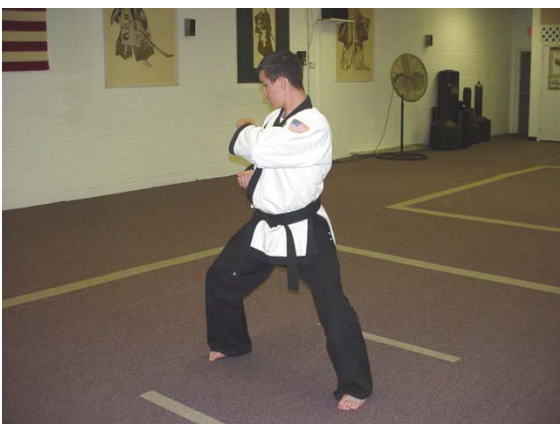
...left reverse punch and right low elbow strike to the rear in side stance.