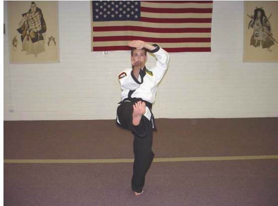
Stepping right front kick, recoil...