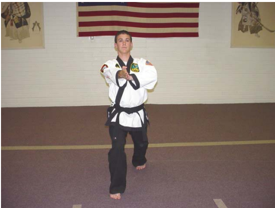
Step through into a right front stance and execute a right reinforced spear hand strike.