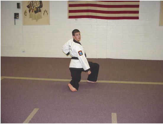
Look over right shoulder.