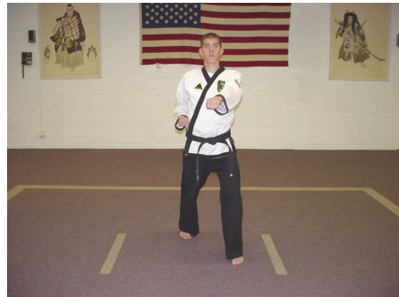
Step through center punch. Kiai!