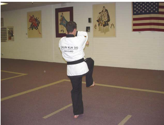
... recoil and load for a right downward extended back knuckle.