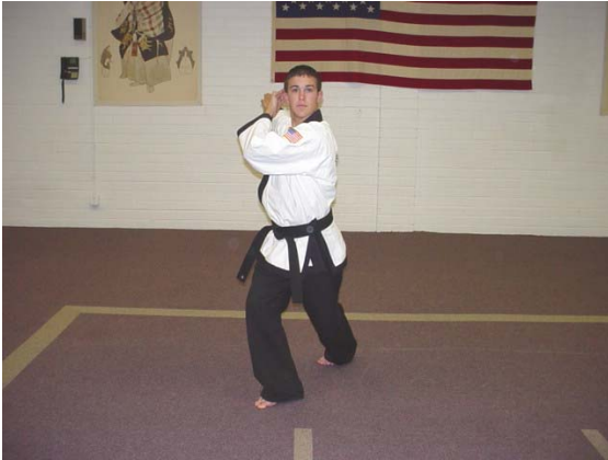
Pivot and load for a stepping left reinforced chop.