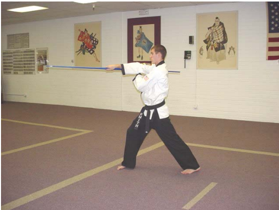
...a right overhead cross strike...