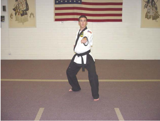
Jam & load for a reinforced spear hand.