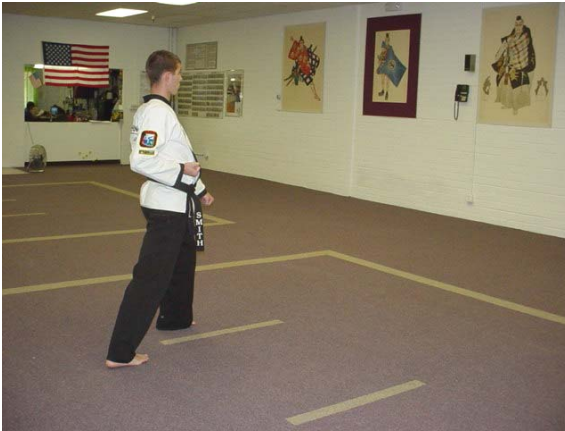
Turn 90 degrees stepping into a left foot forward front stance left low block.