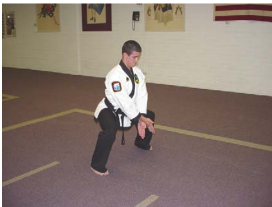
Execute low cross block.