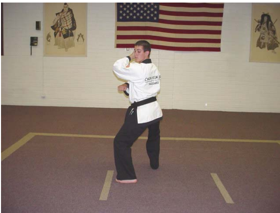
Look left load for a low block.