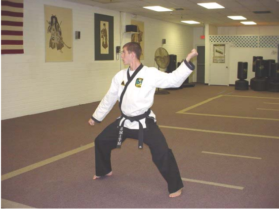
Landing in a side stance, right low block, left back knuckle strike.