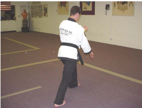
Right hand palm heel strike, groin grab, twist (left hand loaded at shoulder seam at 45 degree angle and slides down the arm)...