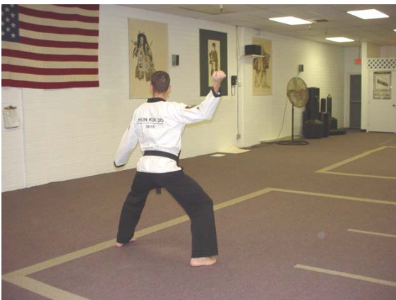
Landing in a side stance, left low block, right back knuckle strike.