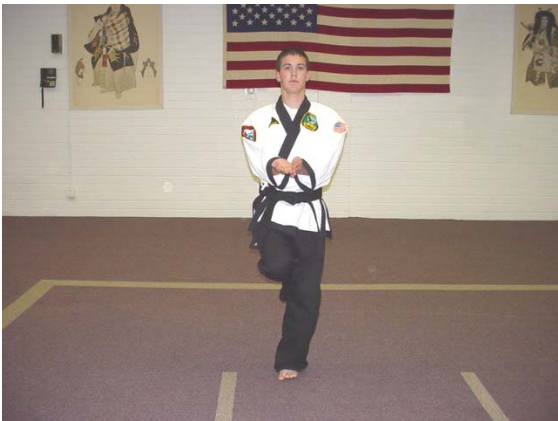
...ending with left hand inside chop into right hand. (Forearms are at approximately 110 degree angle)