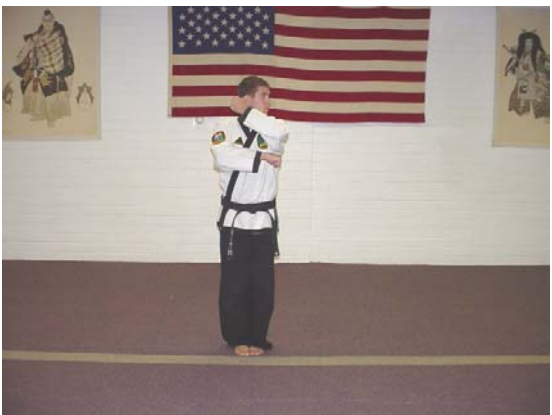
Look left. Jam and load for a left low block.

Slide your left foot next to your right. Simultaneously cover your right fist with the fingers of the left hand. Your left fingers cover the right knuckles. Your forearms are perpendicular to each other and do not touch the body. Keep your knees slightly bent.