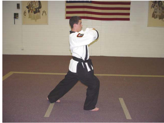
Recoil, land in right front stance. Execute a left cross elbow smash..