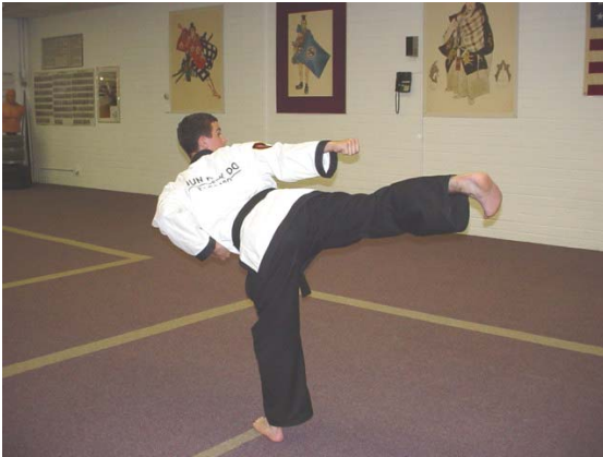
Execute the right bottom fist and sidekick.