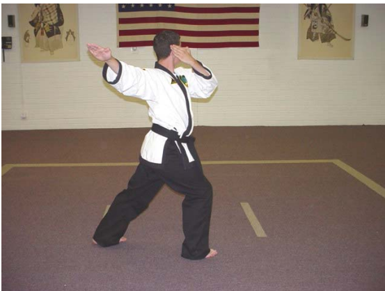
Look left 45 degrees. Load for a left high reinforced chop.