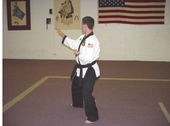
Look right. Turn 45 degrees executing a stepping right high reinforced chop.