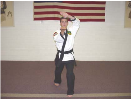
Pivot 90 degrees into a left foot forward front stance and execute a right inside chop and a left open hand high block.