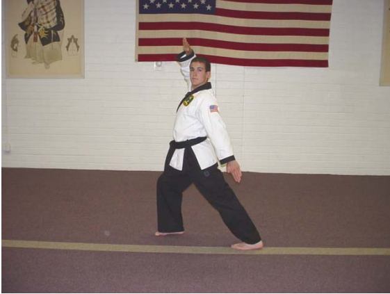
Look left 90 degrees and execute a right open hand high block (palm out) and a left low chop (palm toward the body).