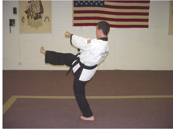
Right stepping front kick and the right hand chambers back...