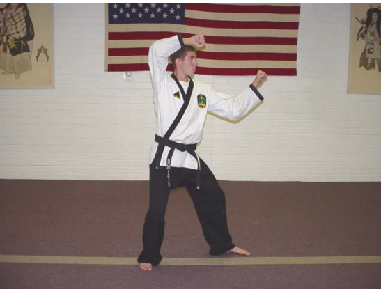
Step left into a back stance and execute both block and a left closed hand knife hand block simultaneously.