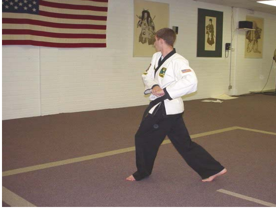
Load on left hip for a right reinforced outside block.