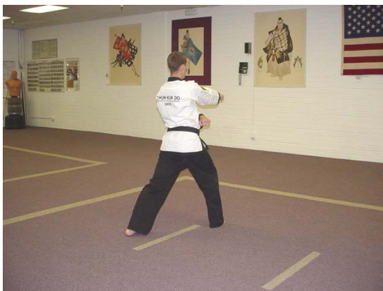
Right hand jam and load for a left hand reverse outside block.