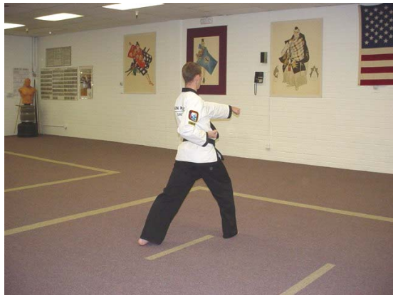
Recoil and step into a right foot forward front stance and execute a left reverse punch.