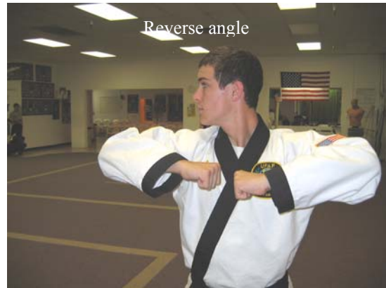
Pivot 180 degrees crossing feet, left over right. Load for double back knuckle.