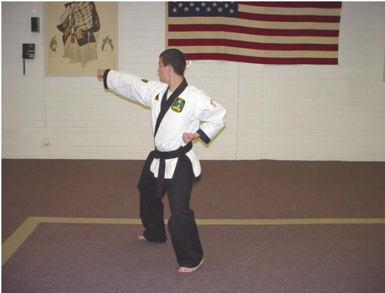
...Recoil and step down into a right foot forward back stance and execute a right jab.