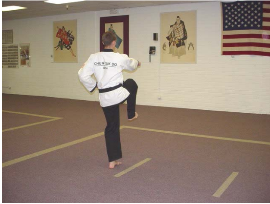
Execute a right stepping front kick.