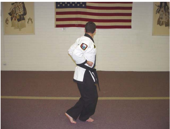
Look left 225 degrees and load both fists on corresponding hips.