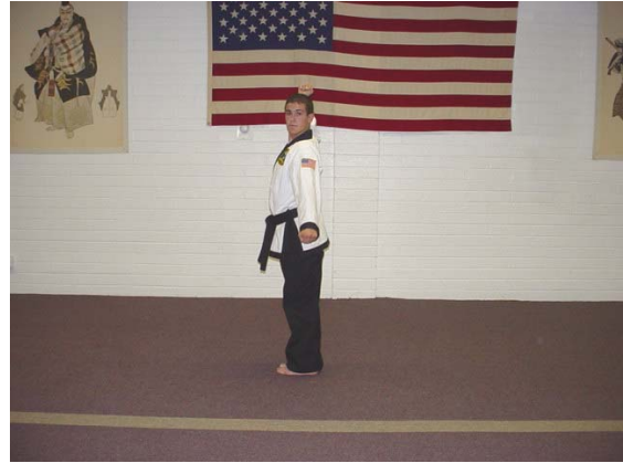
“Pop” right hand up twisting palm to the right and back to front.