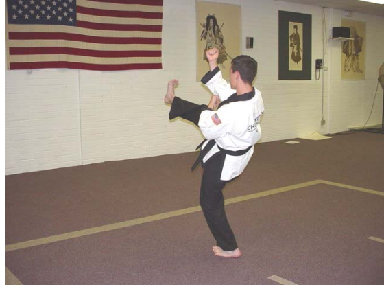
Execute a right leg stepping inside crescent...