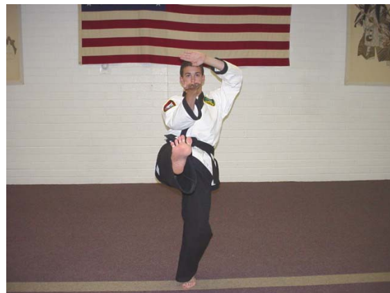
Execute a right stepping front kick.