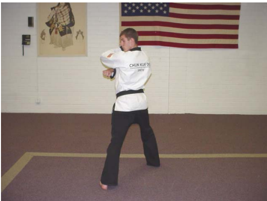
Look left and load for a left hand low block.