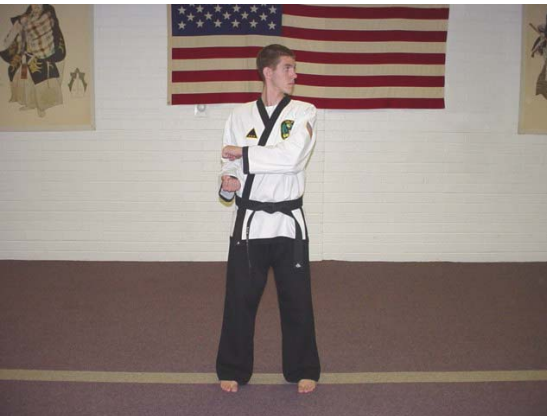
Look left load hand on right hip (left over right) approximately 4 inches apart for a right high block and closed left hand knife hand block).