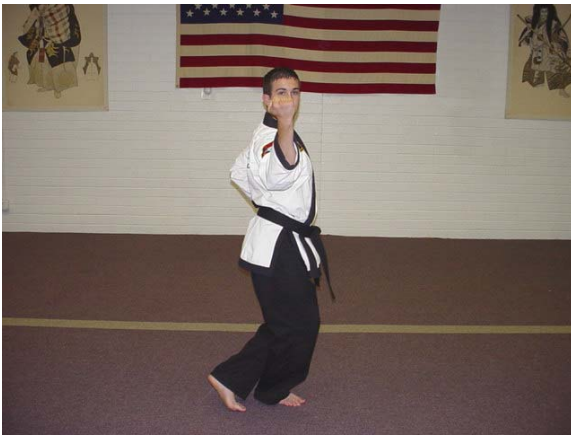
Lunge forward with right foot leading so that you left foot lands behind the right foot and execute a right downward back knuckle. Kiai!