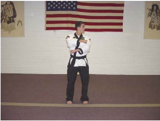
Look left. Jam with right fist and load for left outside block.