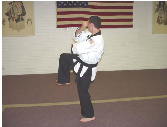
...recoil and load for a right low block.