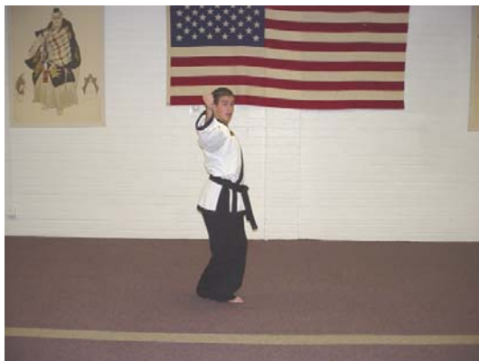
Execute a double back knuckle