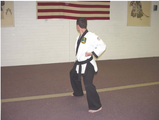
Stomp down with right foot into a horse stance while simultaneously executing a low block.