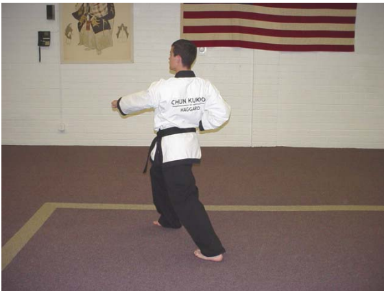
Execute a left reverse punch into a right front stance.