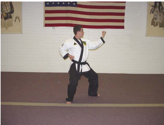
Step off 90 degrees into left back stance and execute a left outside block