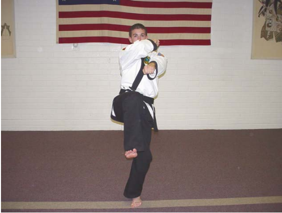
Recoil and load for a downward back knuckle.