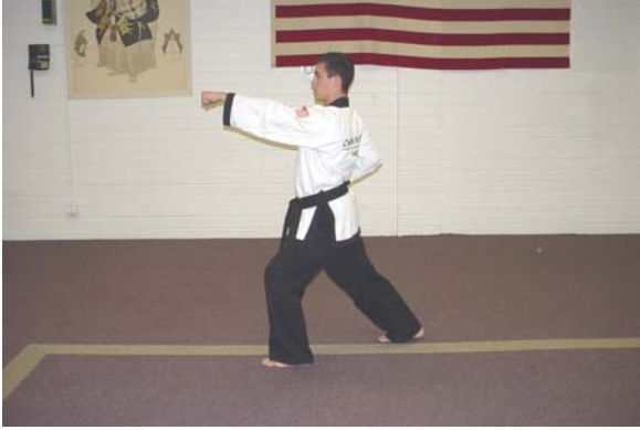
Step into a left front stance while executing a left stepping high punch.