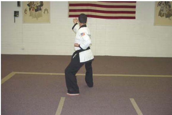
Step forward into a right back stance and execute a right inside block.