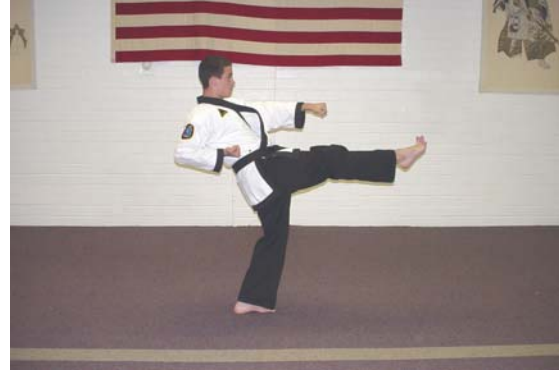
Execute a right stepping front kick with full recoil