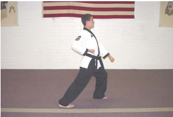
Step 90 degrees counter clockwise into a left front stance and execute a left low block.