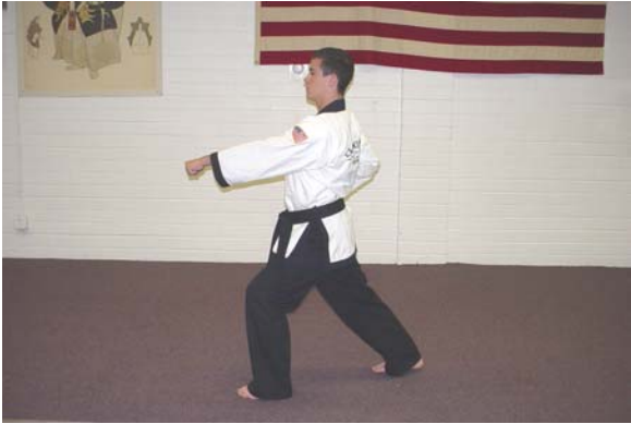
Step with left leg into a front stance and execute a stepping center punch.