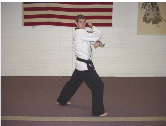
Look right and load for a right hand low block.