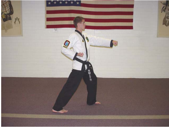
Left jam ...