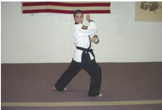
Look right. Jam and load for a right low block.