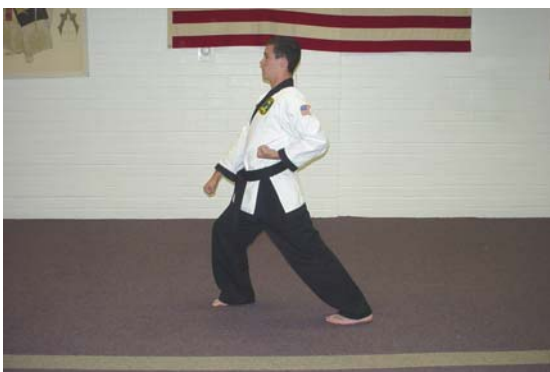
Pivot 180 degrees clockwise on left foot into a right front stance and execute a right low block.