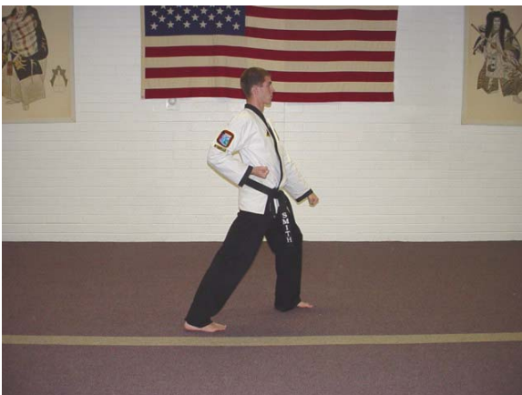
Step into a left front stance and execute a left hand low block.