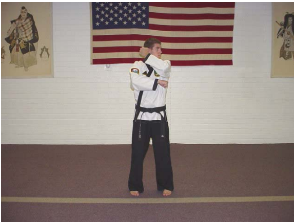
Look left and load for a left hand low block.