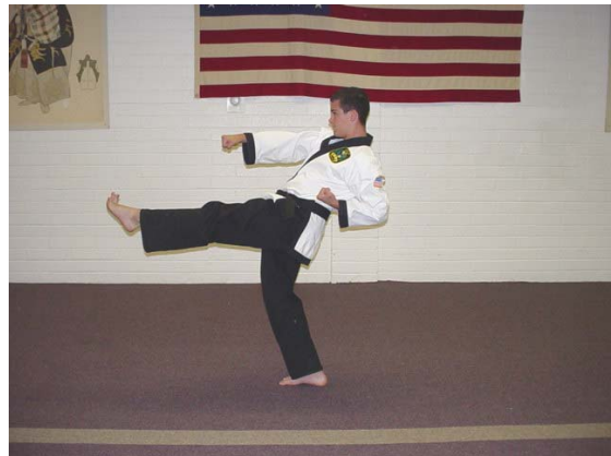
Execute a left stepping front kick with full recoil.