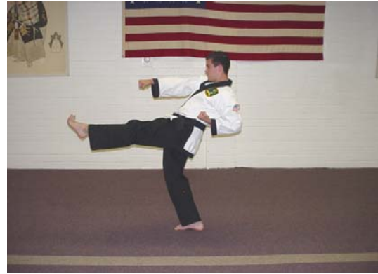
Execute a left stepping front kick with full recoil