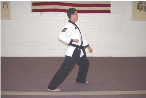
Step counterclockwise 90 degrees into a left front stance and execute a left low block.