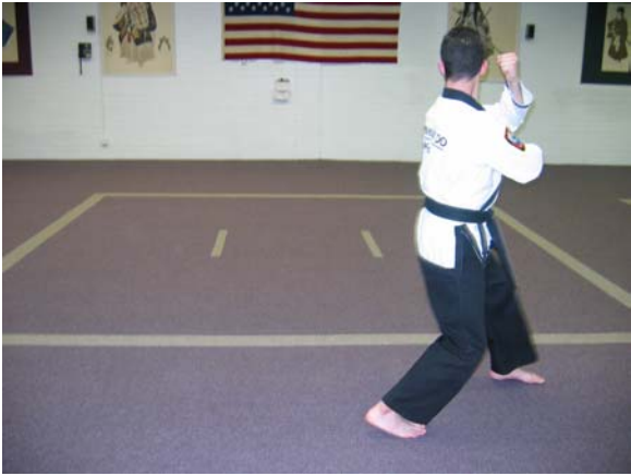
Jam and load for a low block.