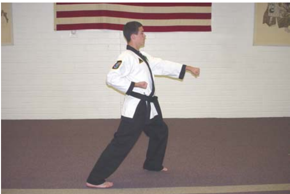
Left jam and load.