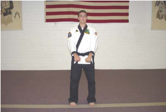
Look left. Parro