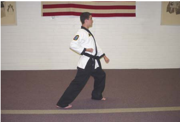
Step 90 degrees counter clockwise into a left front stance and execute a left low block.