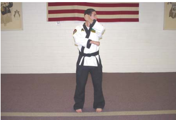
Look left. Jam and load for a left low block.