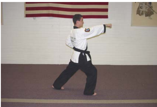
Step down into a right front stance while simultaneously executing a right stepping high punch.