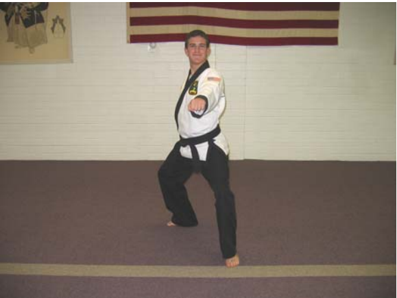
Back Stance – From a front stance position, your front knee remains bent and your knee remains in line directly above your foot/ankle and your front foot pointing straight ahead. Pivot your rear foot 90 degrees pointing to the outside of your body. Shift your body weight from your front foot to your rear foot. 65-70% of your weight is over the back leg. When you shift your weight your rear hip and both knees out, and ankle are in a straight line as if you were leaning against a wall.

Keep your front knee in line directly above your foot/ankle. Your rear foot is pointing straight ahead and your rear knee is locked out and straight. Your weight is forward with 65-70% on your front leg.