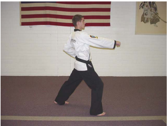
...and execute a right hand stepping center punch.