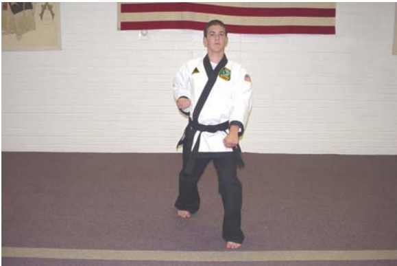
Step counter clockwise 90 degrees into a left front stance and execute a left low block.