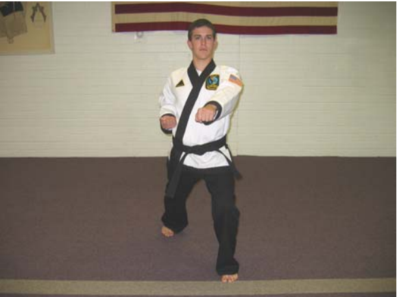
Front Stance – From the Choombee position, while maintaining the spacing between your feet, slide your left foot forward approximately 1 ½ times your normal step when walking.

Your front foot points straight ahead and your front knee is bent so that when you look down at your front foot, you should only be able to see your part of your big toe nail.