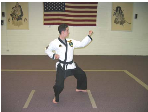
Step 90 degrees to the left into a back stance (leaving the right foot in place) and execute a left outside block.