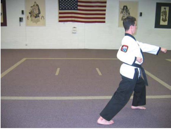
Step with left leg into front stance and execute stepping center punch. Look left. Jam and load for left low block.