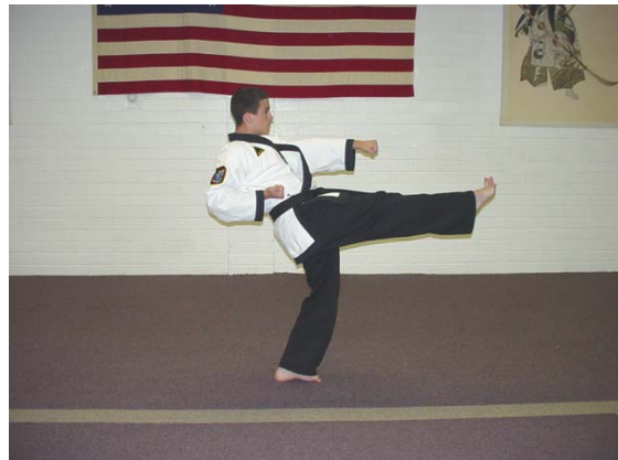
Execute a right stepping front kick with full recoil