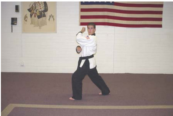
Look left. Jam and load for a left low block.