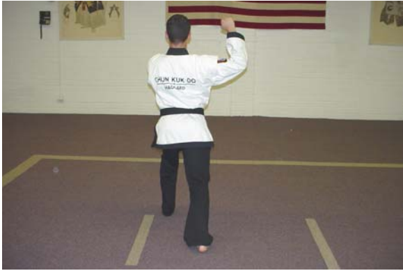
Jam and load for a right inside block.