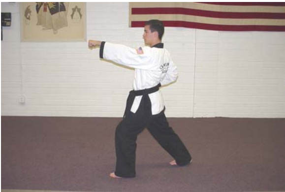
Step down into a left front stance while simultaneously executing a left stepping high punch.