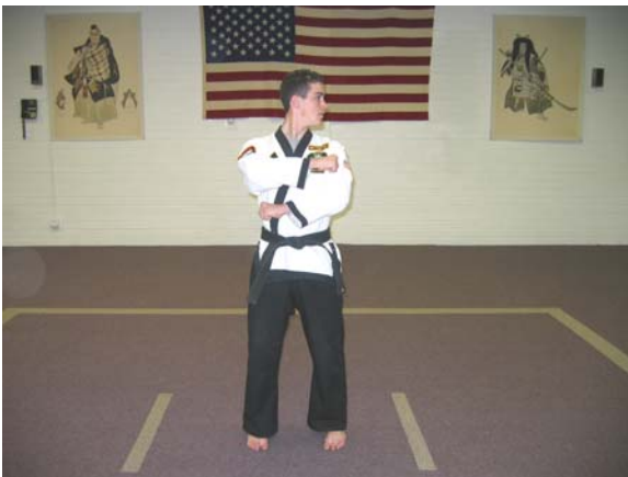
Look left. Jam and load for an outside block.