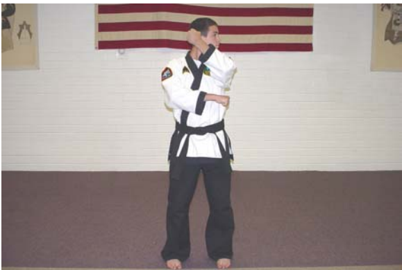
Look left. Jam and load for a left low block.