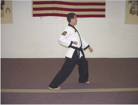
Pivot counter clockwise 270 degrees on the right foot into a left front stance and execute a left low block.