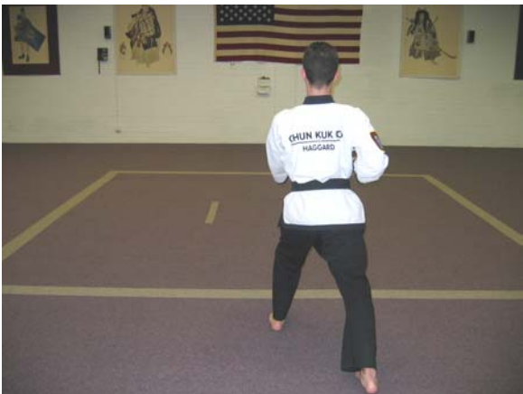
Step counter clockwise 90 degrees into front stance and execute low block.