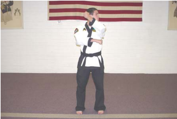
Look left. Jam and load for a left low block.