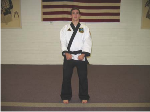
Parro – Return to Ready position