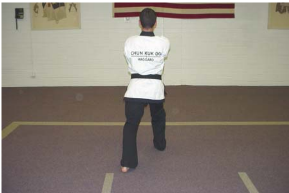
Jam and load for a left high block.