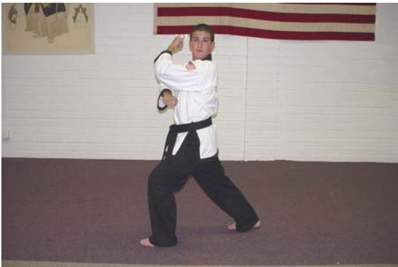
Look left. Jam and load for a left low block.