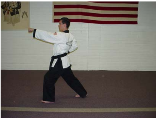
Step down into a left front stance while executing a left stepping high punch.