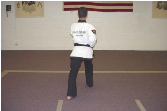
Follow immediately with a left reverse punch shifting into a right front stance.